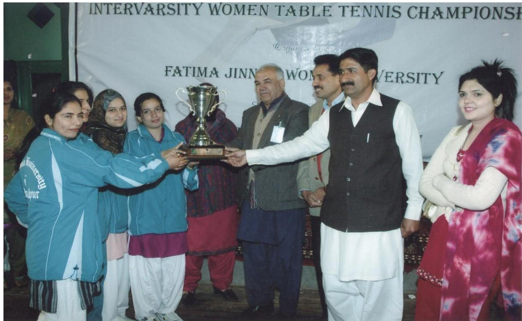
Championship Trophy is being given to the Women Table Tennis Champion Team of Islamia University Bahwalpur, 17 th to 19 th February 2010.