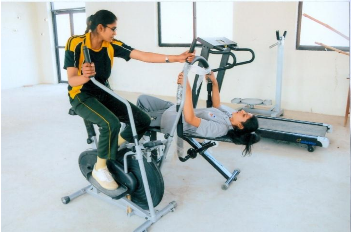
Players during an Exercise Session in HEC Supported Fitness Centre Established at Lahore College for Women University